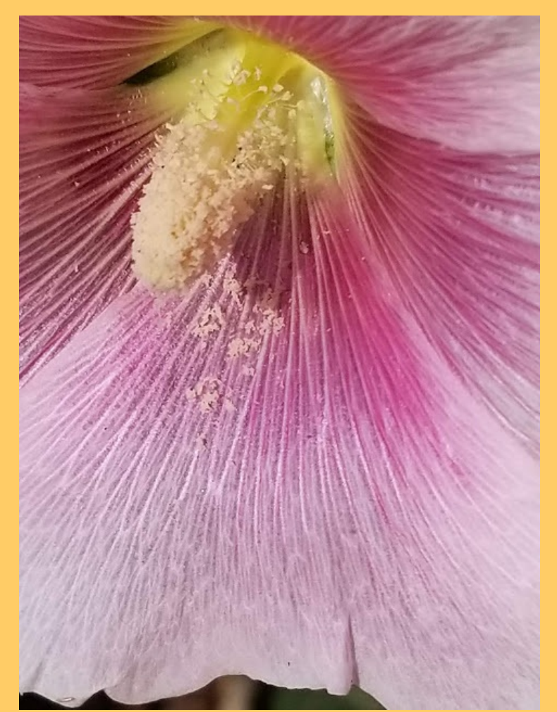
We inspire men with clarity of omnipotence, omniscience, and omnipresence,

Just as the inbreath becomes the outbreath, so does the outbreath become the inbreath.