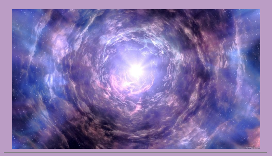
The Law of One is the original law of Creation,