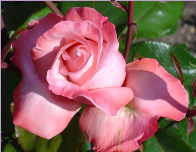
....as we protect and nurture all those in the next world who make preparations to enter life on this Earth.

In the Invisible World, in the zone girdling the earth, where those who are ready to incarnate live,