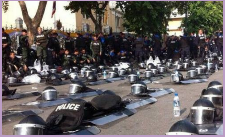
Police remove helmets and sit down to join people in Thailand.

When justice is called for, we rush in and declare this Law.