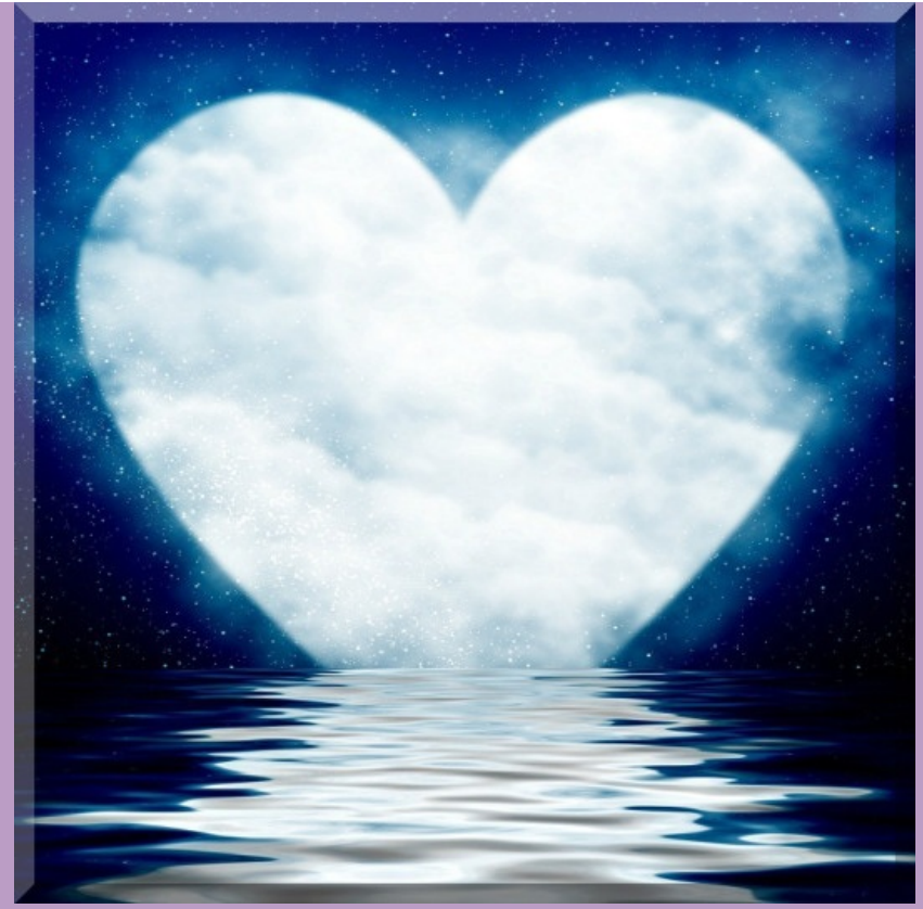
As little children in the arms of our Divine Mother of flowing Love and Life, manifest the Kingdom of Heaven on Earth with ease and joy!

Swim with the emotional tides of the moon, not against them!