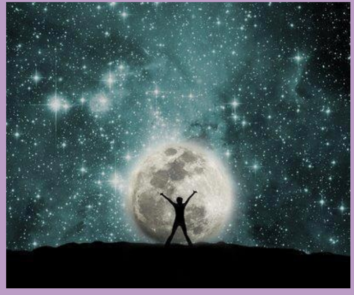
Moon cycles are keys to the mastery of mysteries of LIFE, EMOTION AND THE ASTRAL PLANE.

Remember that flowing emotions are precursors of change in physical forms.