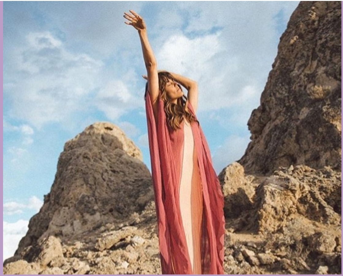
Feel free to share these messages

If you wish to unsubscribe from the angel messages, please go to yahoo.com, click on groups,