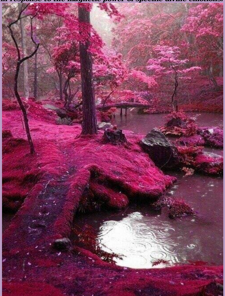
Water is the physical manifestation of emotions.

Everything in nature is formed on the material plane in response to the magnetic power of specific divine emotions.