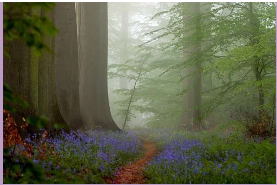
ChThis is the sound of clarity and perfect purity.

The color is light violet, the musical note is D-sharp, and it has the sensation of coolness because it is the water element of feeling. The left leg is formed by this virtue.