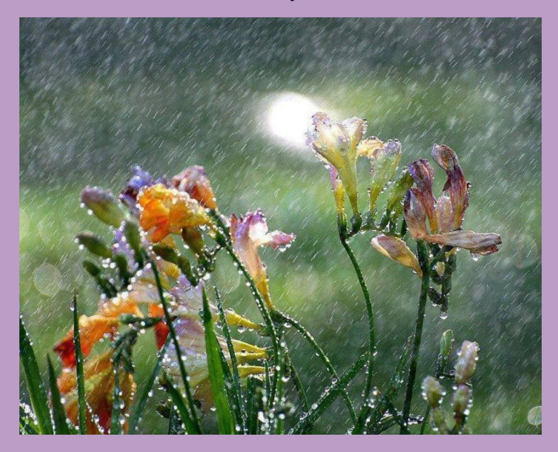
Omnipresent Divine Being rejoices each time anyone is healed.

There are many cures in natural medicine, which we have yet to reveal.