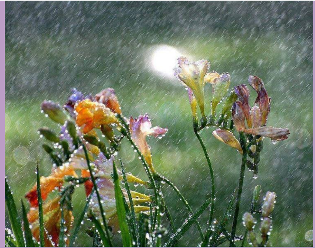
Emotions of transmutation, the divine virtue of umlaut A, ae, are emotions of letting go of negative energies for changes into other states that are the highest good of all.

This makes room for creations of the highest perfection to occur.