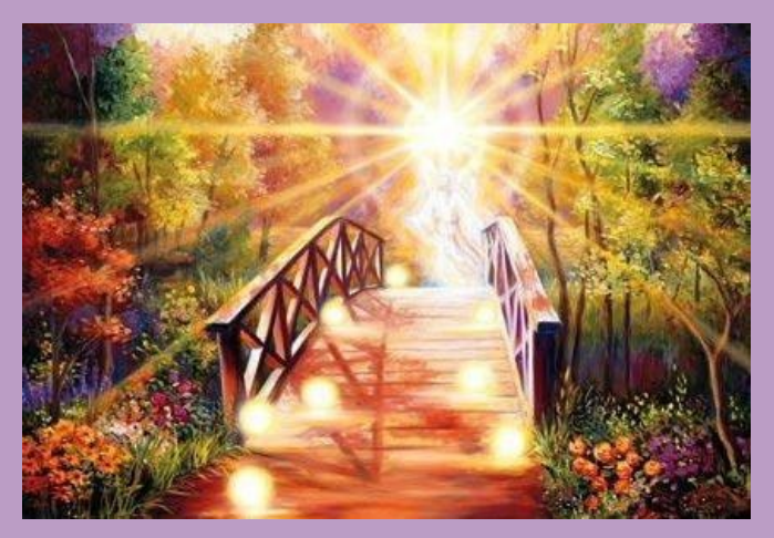
We are the heavenly host that protect and empower all medicinal springs on the earth.

Earth is a heavenly paradise for all life just as it was created to be.