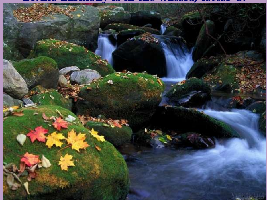
Feelings of grace and mercy, true divine blessings, pour forth from these waters, again the divine virtue of letter G.

Divine harmony is in the waters, letter O.