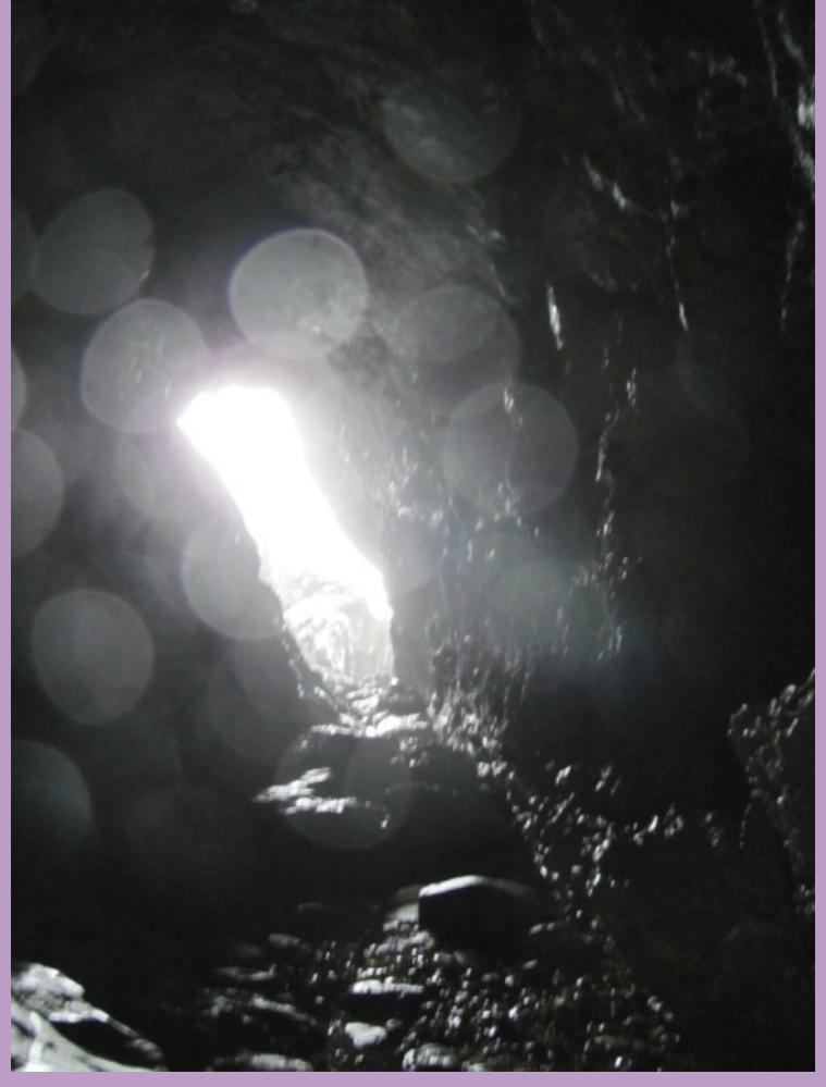
Cognition brought about by love divine is the key to

This alchemical virtue of Divine Love is present in healing springs and causes transmutation into original divine perfection.