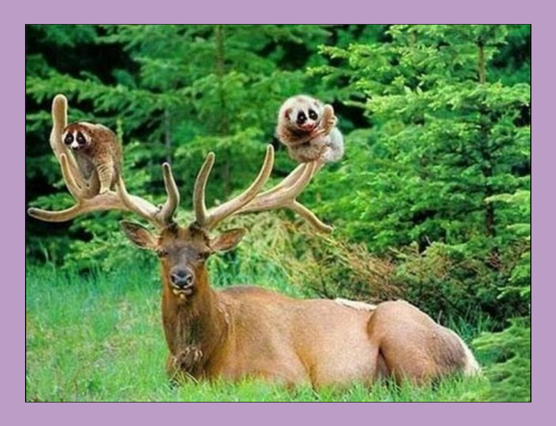
With our assistance mankind has learned from the animals how to cure themselves of many diseases with the use of medicinal waters.

We guide animals to step into certain waters instinctively in the case of injuries.