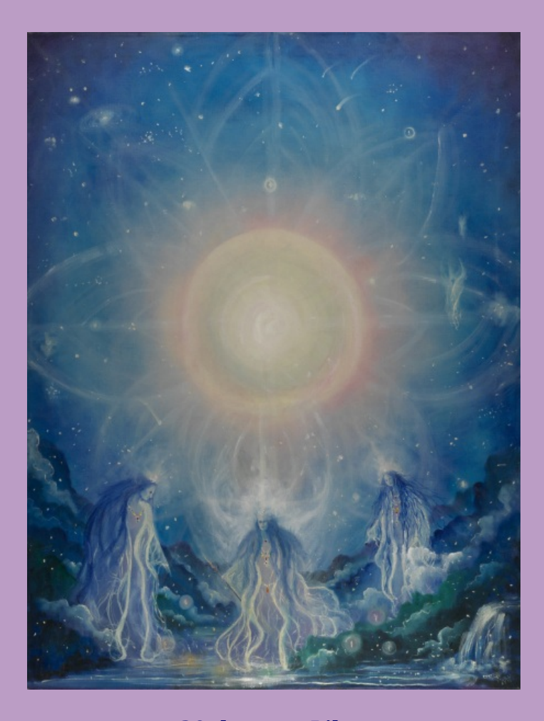
30 degrees Libra