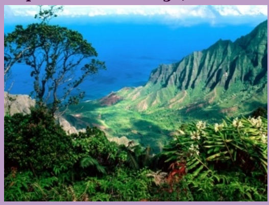
Through the divine virtues of our name Merki, we inspire people with the ancient wisdom of nature, so that the Earth and her waters can manifest in their original pristine condition.

In the time of the Alpha and the Omega, Earth and Heaven are One.