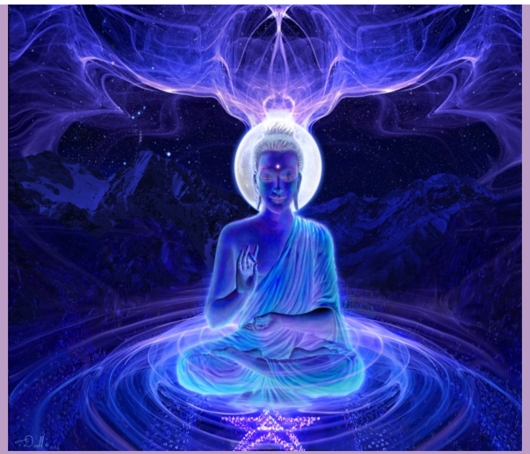
This is the faith that was spoken of in the Bible that moves mountains and does all things.

In the soul, which is also called the astral or emotional body, this virtue manifests as endurance, toughness, courage, and the ability to remove any emotions of fear within yourself or within others.