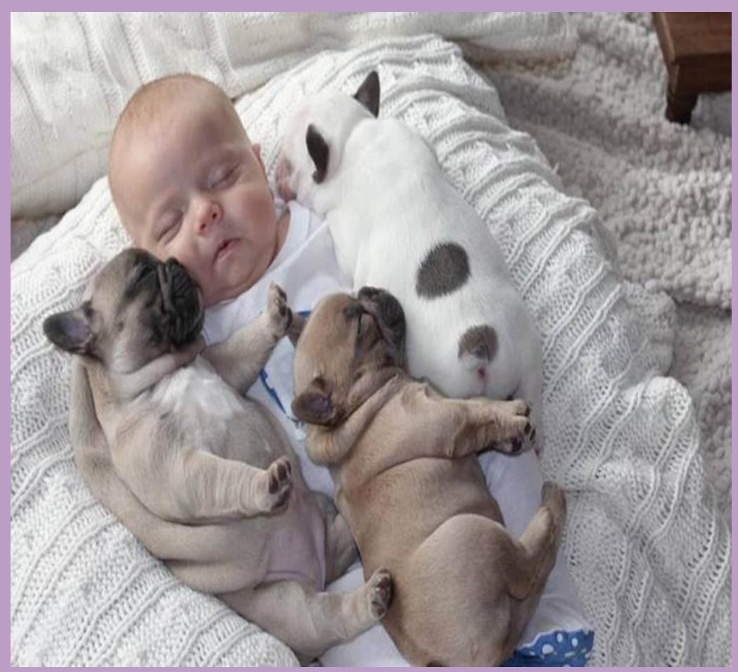
In infancy the Delta brainwave pattern of Pure Being and unity with Divine Being and all creation is dominant.

We help preserve this state of awareness in all People of Light and Flowing Love, regardless of physical age, so that important chemicals are produced through glands that result in youthening and other divine physical manifestations.