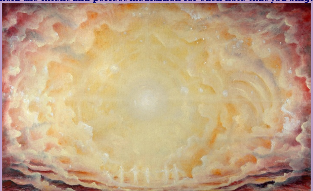
Through the divine virtue of the letter Q, which is the same as K and U together, in our name Riqita, we inspire the greatest faith to change fate for the better.

you hold the intent and perfect meditation for each note that you sing!