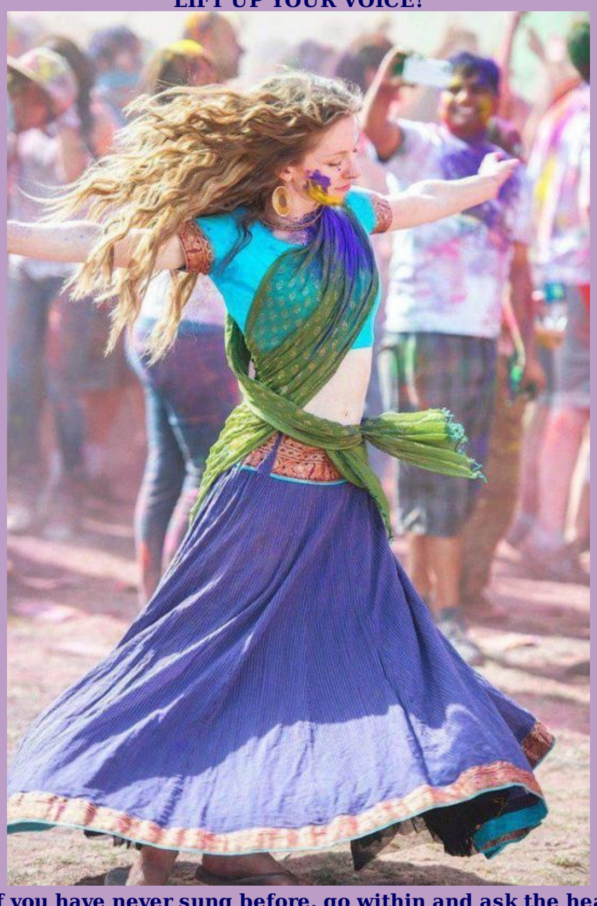
Even if you have never sung before, go within and ask the heavenly