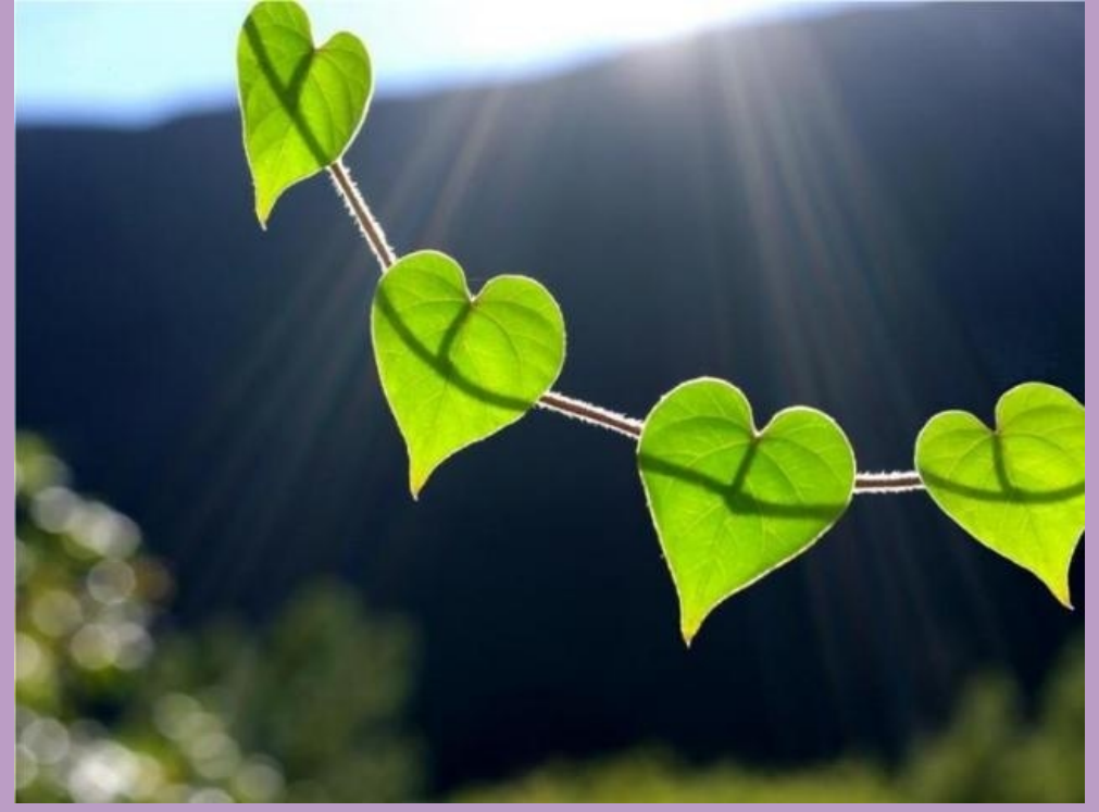
In so many situations, what greater gift can you receive, or give? It is easy.