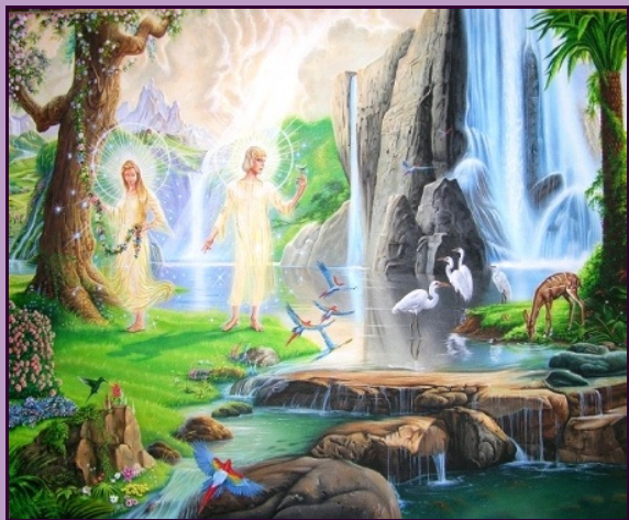
Conscious use of imagination with breathing is a basis of yoga, or