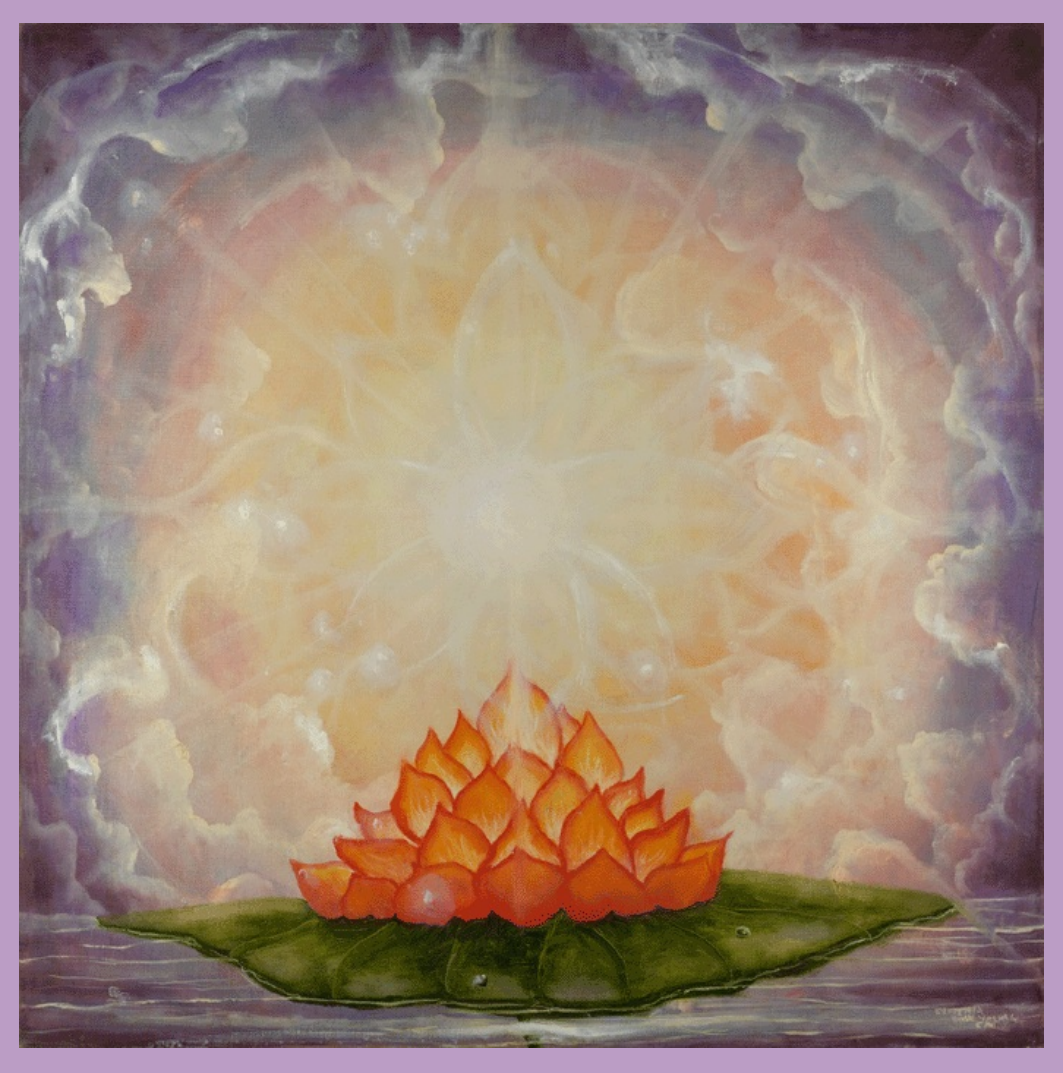
oil on linen