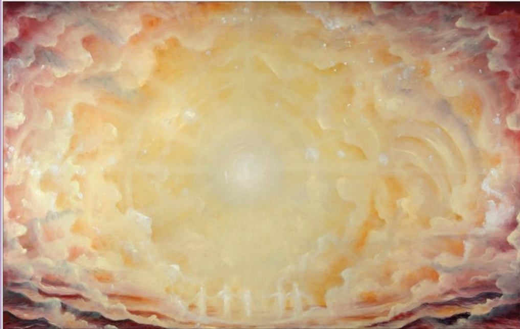
painting by Cynthia Rose Young Schlosser oil on linen

The color of this virtue is gold, the musical note is C, the element is earth so it is felt with a sensation of weight, and the left side of the nose is formed from it.