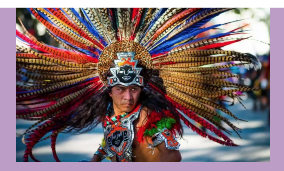
"For I have not given you the spirit of fear, but of joy, and life everlasting."

We inspire children of light and love to endow objects, forms, and places with powers of holiness that endure!