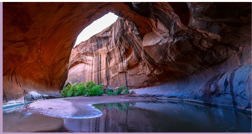
Oh children of light!

Transmute even the least of Earths stones and material forms into chalices of Divine Remembrance.