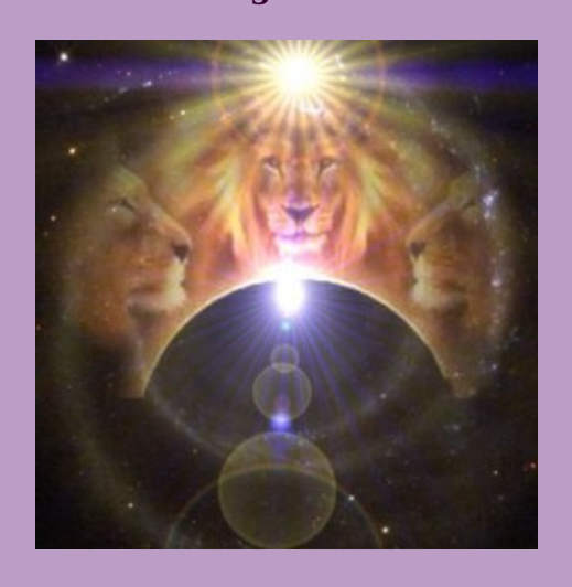
19 degrees Leo