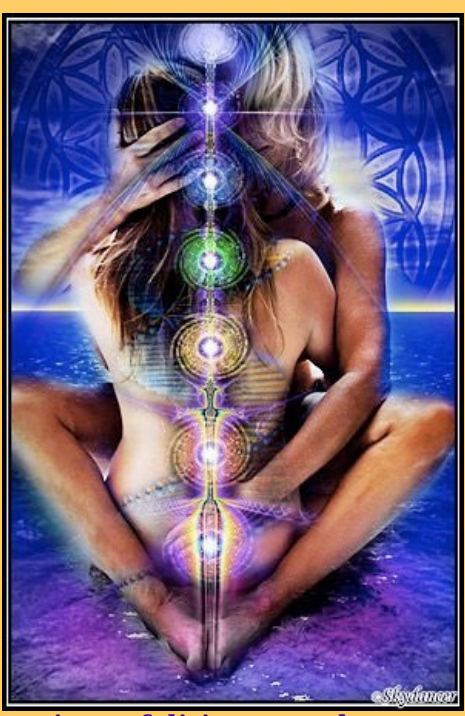
Divine Flowing emotions of <u>divine sexual ecstasy</u> are transmitted throughout the Unified Field by the heavenly hosts of 'E-N-Ch-E-D-E'.

Whenever a child of God wishes to arouse emotions of Divine sexual attraction for the purpose of supreme happiness and the highest good of all, we respond bringing clarity and and perfect purity, removing all obscurity.