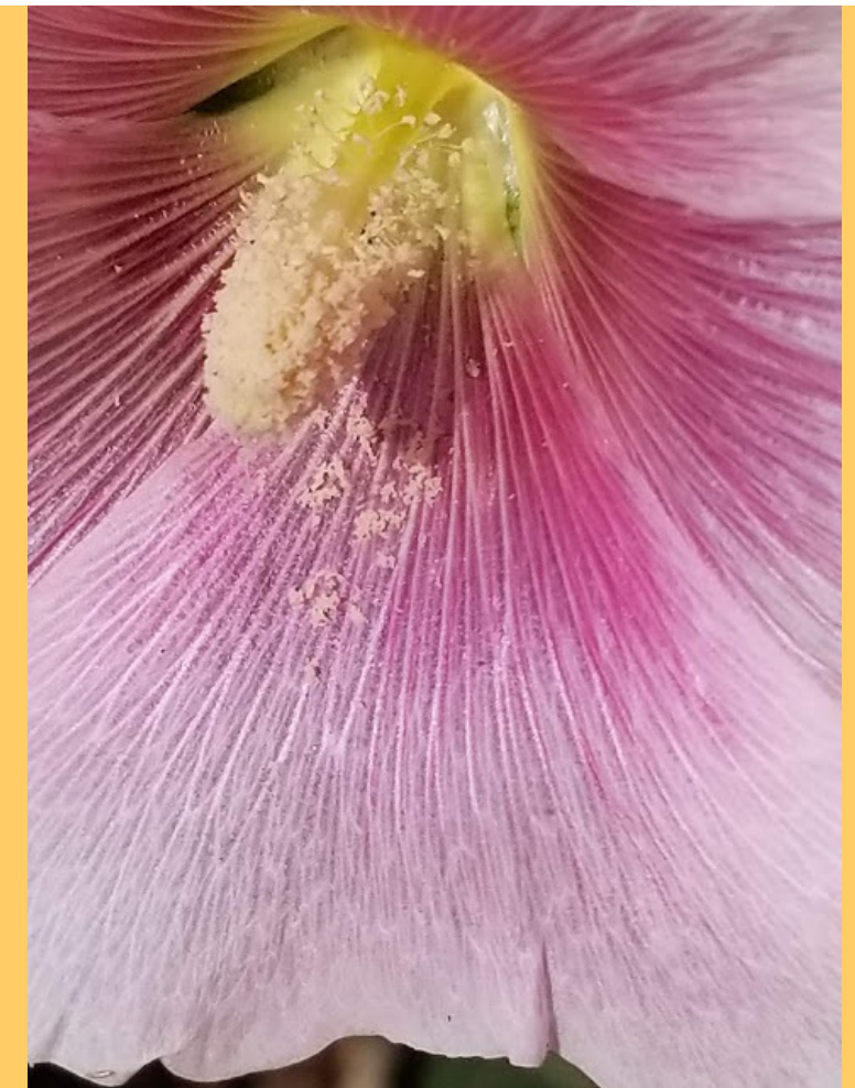
We inspire men with clarity of omnipotence, omniscience, and omnipresence,

so that a man does not alter polarities by seeking to receive divine pleasure from a woman, but rather to give divine pleasure, staying in his masculine polarity of electricity, or giving.