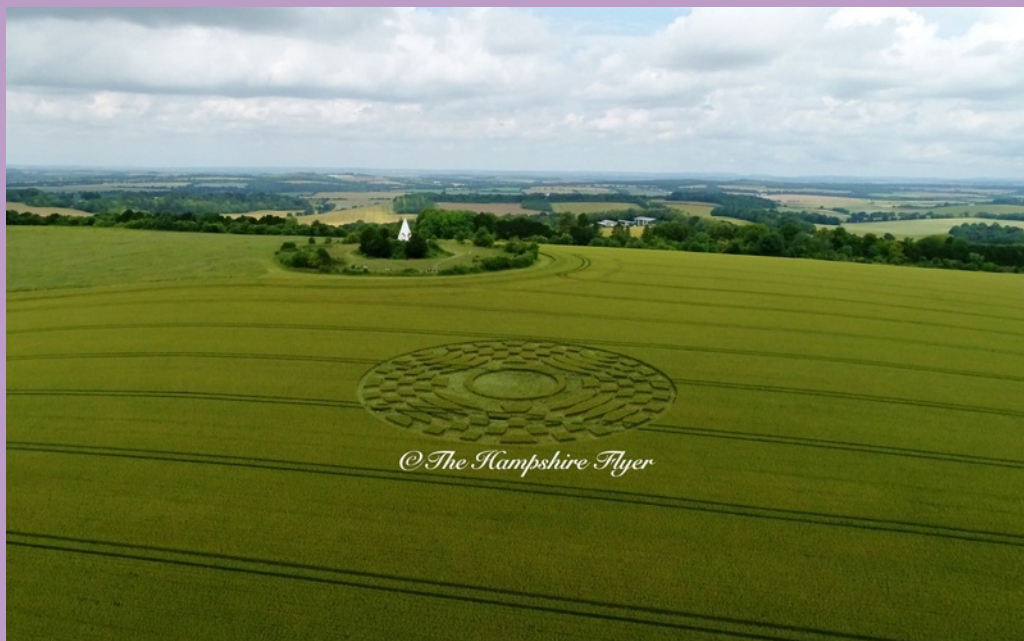
Martinsell Hill, Nr Wootton Rivers, Wiltshire. Reported 7th July, 2018.

We inspire divine faith and understanding in the children of light, faith and understanding of the goodness and beauty of creation, faith and understanding of intelligent processes at work that guide the evolution of everything.