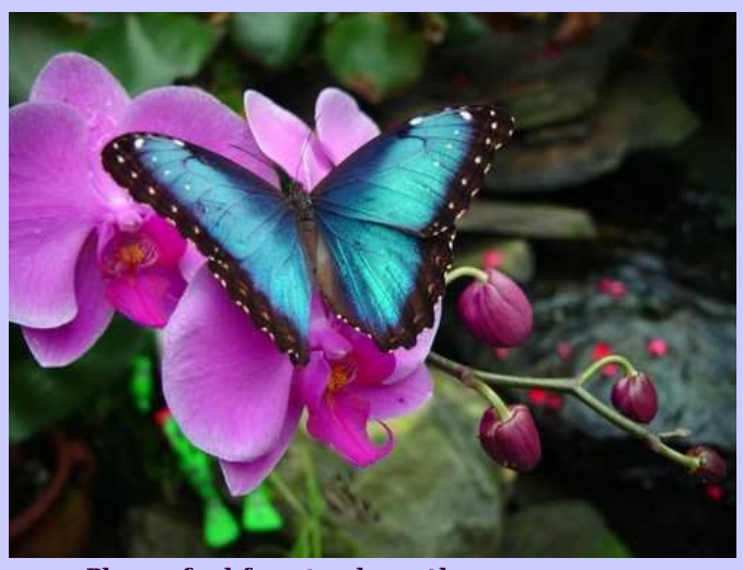
Please feel free to share these messages.