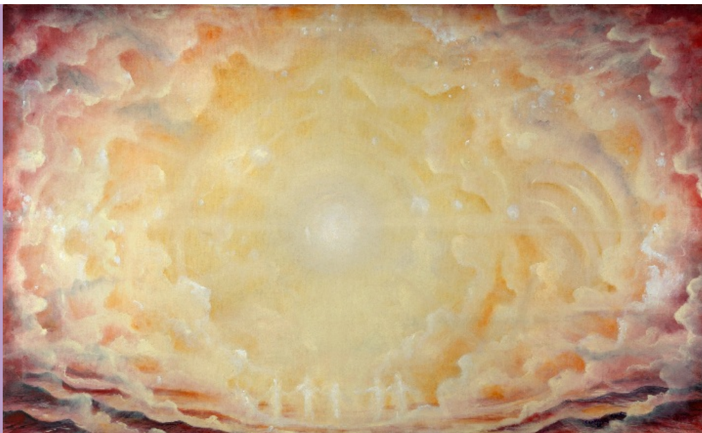
Family of light oil on linen