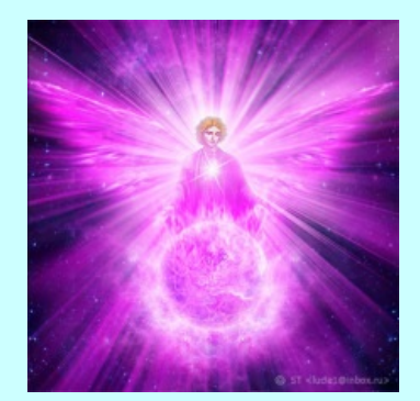
The letter H is The Power of the Word.

to any negative desire, value, idea, situation, emotion, or possession, so that they can move on to greater enlightenment and manifest beauty for all .