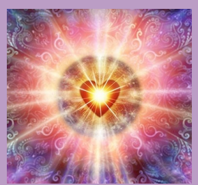
Please feel free to share these messages