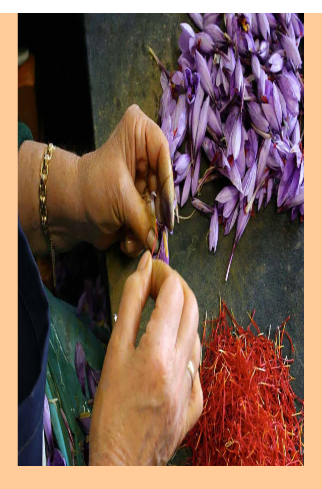
Herbs become capable of changing a persons fate in a way

that is for the highest good of all concerned, on levels of being, mind, feeling, and even form.