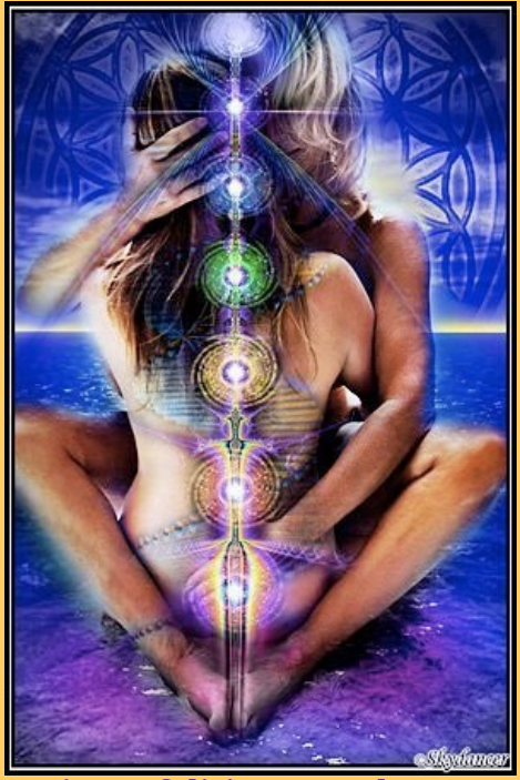
Divine Flowing emotions of <u>divine sexual ecstasy</u> are transmitted throughout the Unified Field by the heavenly hosts of 'E-N-Ch-E-D-E'.

During the 6th day of each moon cycle, flowing emotions of sexual kundalini, or life force, is heightened and protected and blessed throughout all kingdoms of life.