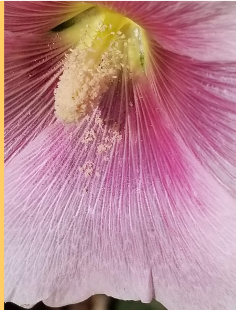
We inspire men with clarity of omnipotence, omniscience, and omnipresence,

so that a man does not alter polarities by seeking to receive divine pleasure from a woman, but rather to give divine pleasure, staying in his masculine polarity of electricity, or giving.