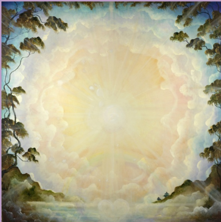
The Awakening, Oil on Linen, Cynthia Rose Young Schlosser

Umlaut O. eu... 'Akasha: In the principle of consciousness penetrating all, the umlaut O oscillation evokes the most profound cognition which can only be brought about by love divine.