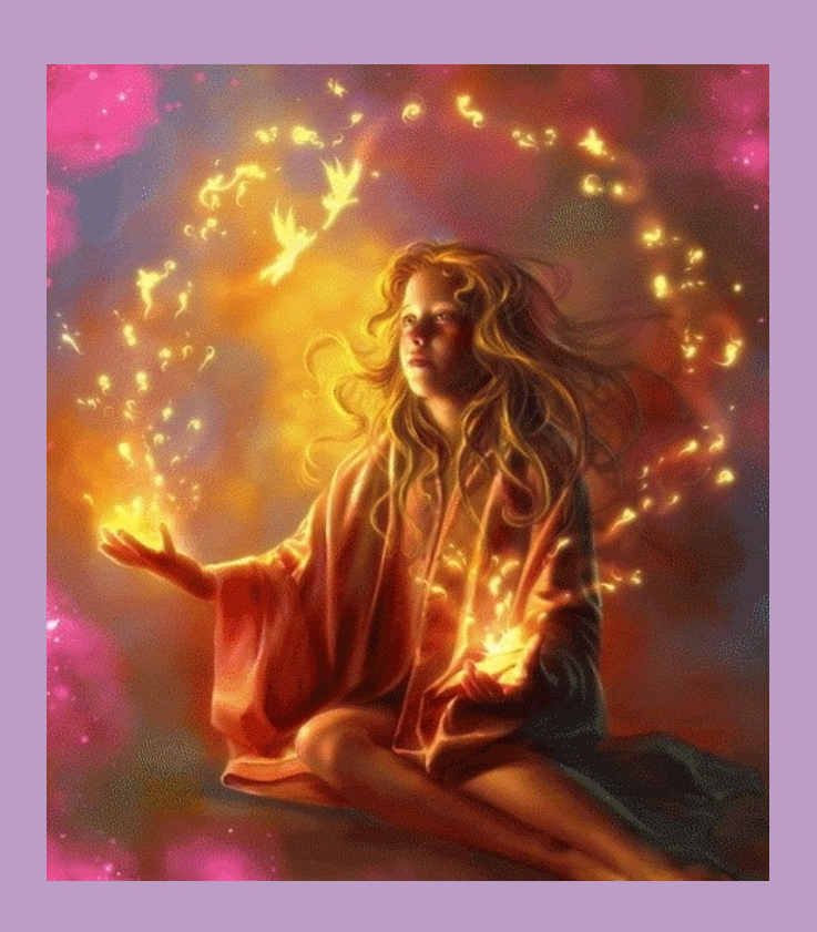
8 degrees Aquarius